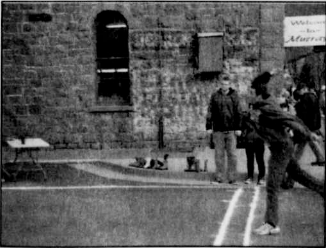
A participant throws the "welly" during last year's St. Patrick's Day celebration.

The boots are set to fly on St. Patrick's Day weekend at the annual "Welly Toss." Everyone is reminded to get their teams entered or, if preferred, to come by and throw as an individual and bring the kids.