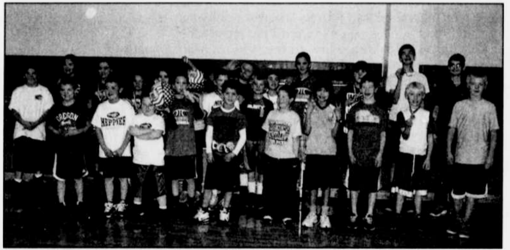
Some of the participants in the Heppner Elks Hoop Shoot, held Dec. 16 at Heppner Elementary School.

The Heppner Elks Club held its annual Hoop Shoot on Dec. 16 at Heppner Elementary School. Winners are as follows: