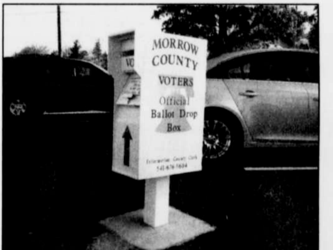
Dropboxes like this one are available throughout the county for voter convenience.

Heppner: Courthouse parking lot (24 hours) or the Morrow County Clerk's Office, Room 102 inside the