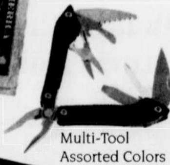
Multi-Tool Assorted Colors