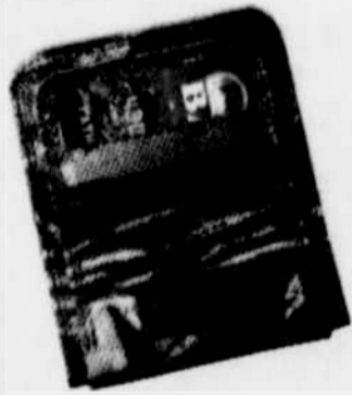
Front Pocket Wallet