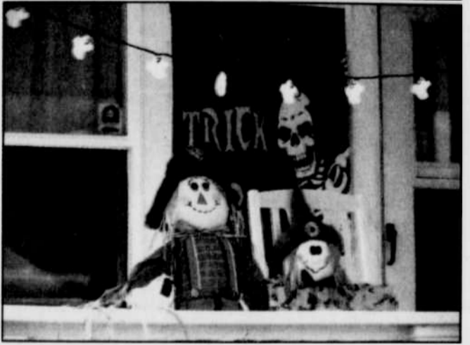
The local ghosts and ghouls are starting to make an appearance in preparation for Halloween next week. Above: This skeleton seems to be stuck in this yard on Cowins in Heppner...or is it on its way out for a romp? Below: These friendlier scarecrows greet passers-by on Gale Street.