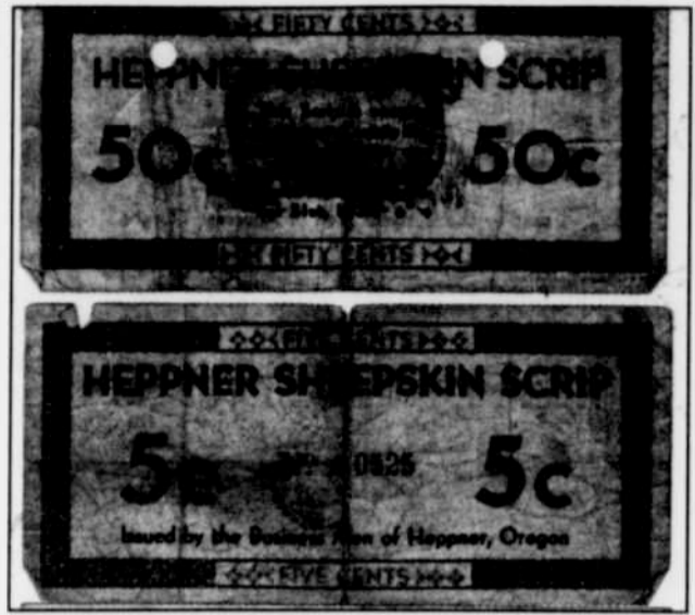
Some of the scrip issued in Heppner during the Depression to replace scarce US currency.

A final accounting on January 4 of 1935, when the scrip was discontinued, shows that $5,670.65 in scrip had been issued over the life of the program,