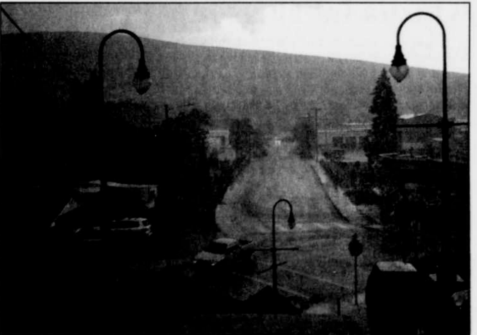
A view from the Morrow County Courthouse toward Heppner's Main Street during last week's hail storm. Vehicles around the area received broken windows and dents during the July 17 storm; roof damage was also reported in some places, as well as minor crop issues. All in all, though, the county emerged largely unscathed from a storm that hammered the area with hailstones some witnesses said were as large as ping-pong balls.