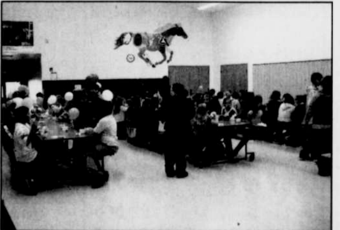
Students at Heppner Elementary celebrate their success on the Oregon Statewide Assessment (OAKS). Students celebrated with ice-cream sundaes with all the toppings. Each student received a balloon with notes inside, some congratulating them on their achievement and some with donated prizes.

If you or someone you know has a gambling problem, help is available and that help is FREE of charge.