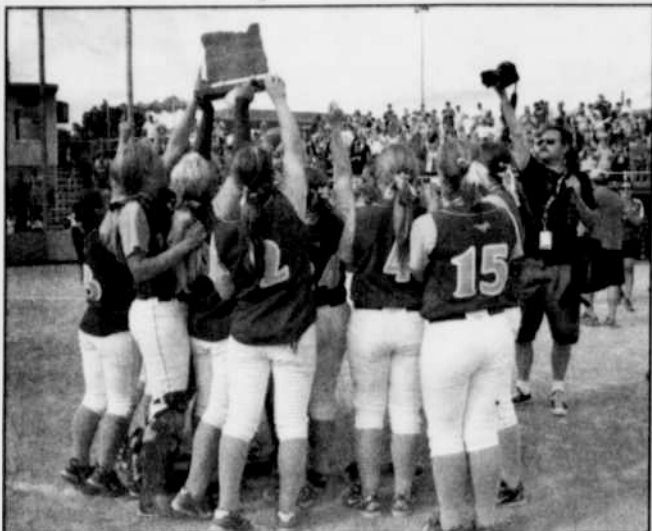
The Mustang softball team gathers around the state championship trophy as they celebrate their victory over the Glendale Pirates last Friday. The Mustangs held off the nearly-unstoppable Pirates for a 4-2 victory and the 2012 state title.