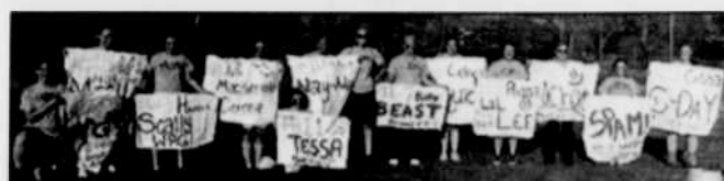
The Heppner softball team celebrated a victory over Echo last Tuesday night. They have locked in first in league and are ranked first in state going into district finals. Mustang softball will be hosting districts in Heppner on Saturday, May 19.