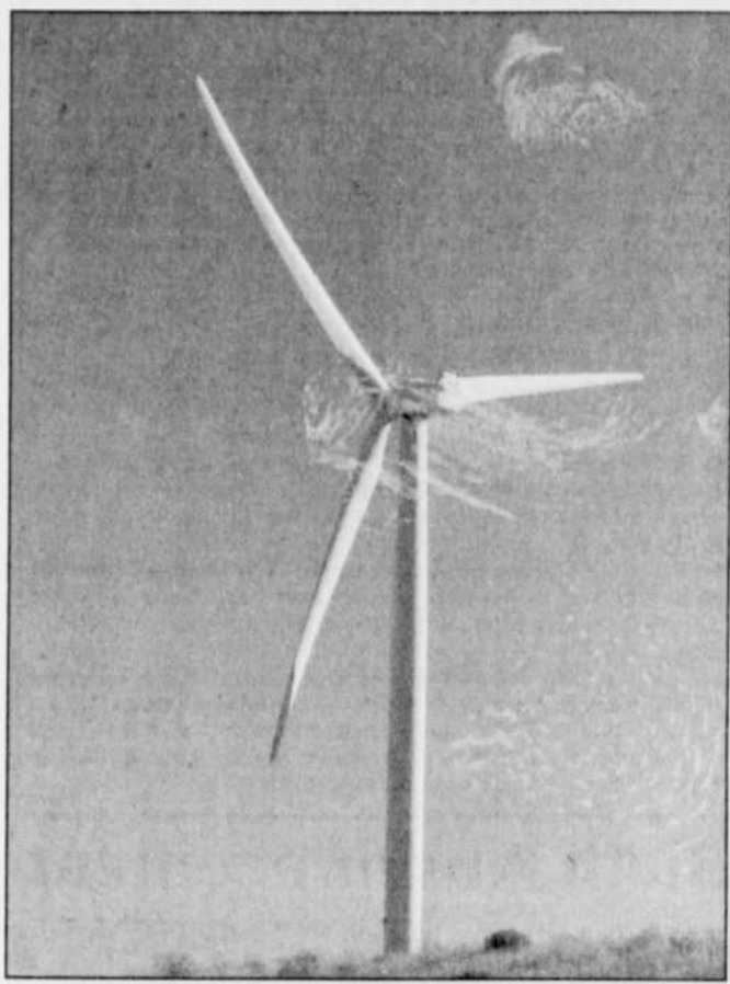
310 wind towers like this one will stand on the Heppner Wind project if it goes through.

Invenergy already has one wind project in the area near Ione, and people from the company have been