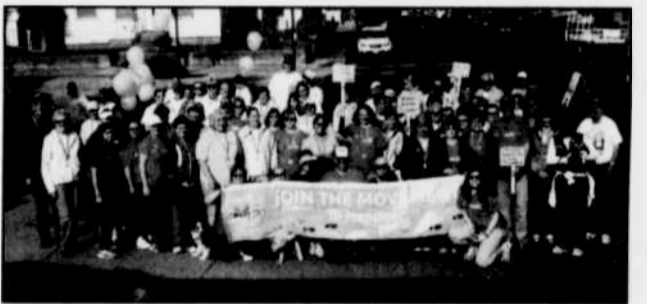
Last year's Walk MS participants proudly display their banner by Heppner's City Park.