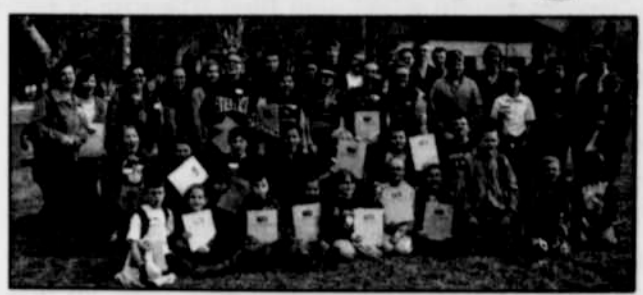
Twelve students from Heppner schools attended a writing workshop at EOU recently. They were among more than 200 students total who attended the hands-on workshop.

There is no registration fee for Walk MS, but