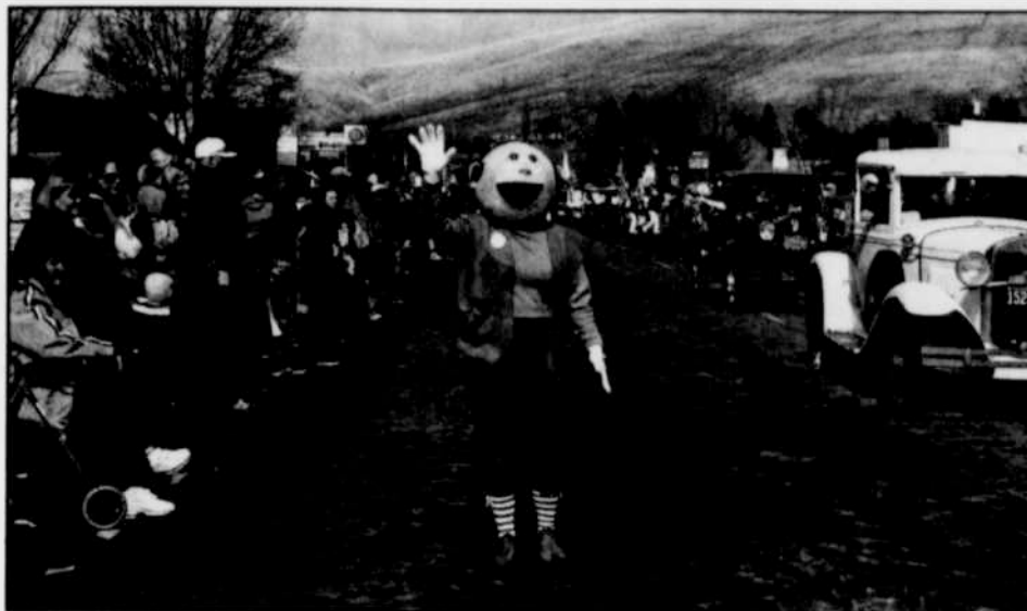
Cloudy skies, wind and even a hailstorm didn't keep people from turning out in force for Heppner's 30th annual Wee Bit O' Ireland Celebration last weekend.