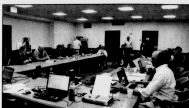
A local group visits the "war room" at the Capitol in Salem where volunteers monitor the legislation going through the legislature. -Contributed photo

The next day, on Feb. 22, the group started their day at 9 a.m. in the Capitol "War Room," which is where people can meet to follow and discuss issues and legislation. Edwards, Representative Greg Smith and Senator Doug Whitsett addressed the group there. A group of volunteers monitors the legislation going through the capitol and will send out emails to