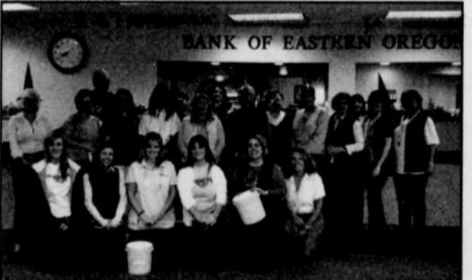
Bank of Eastern Oregon's employees had a loose coin challenge amongst departments to see which groups could collect the most coins to donate to the Susan G. Komen Foundation. Pink collection buckets were placed in each building. BEO's employees came up with $473.79. Bank of Eastern Oregon will match that figure, rounding it up to a $1,000 donation.