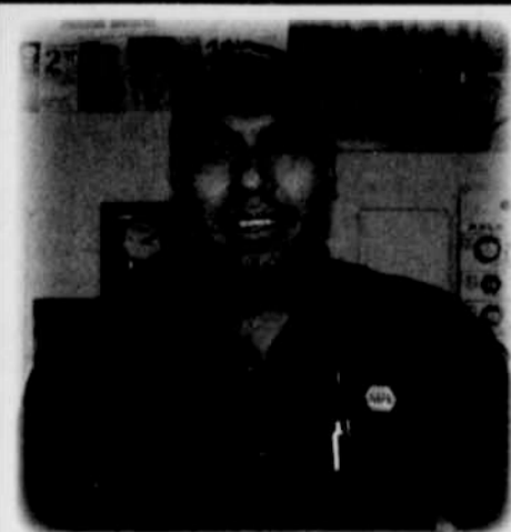
Morrow County Grain Growers