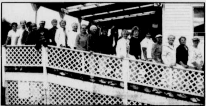
The ladies of Willow Creek Country Club celebrated the end of the season with their last 2011 play day on September 27.

The Willow Creek Country Club ladies held their last scheduled play day of the year on Tuesday, September 27. A "cross-country scramble" was followed by a luncheon meeting and awards.