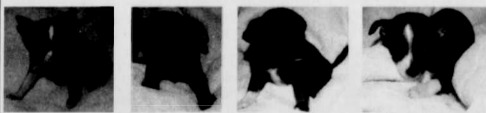
Boy 1 Boy 2 Boy 3 The Girl

9 weeks old, have first shots Call April at 541-980-4643