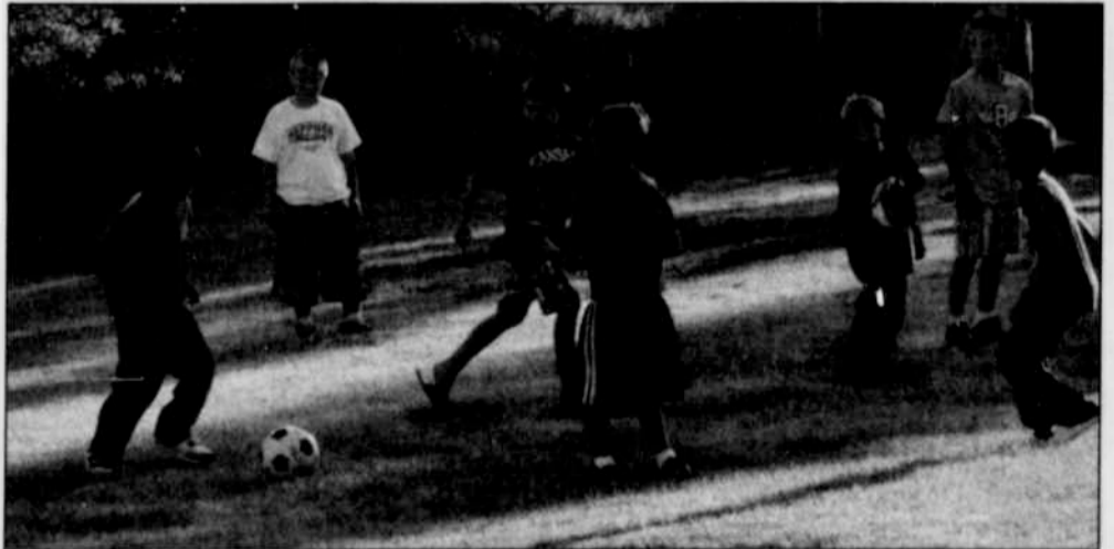
The school year opened Monday for these kids at Heppner Elementary school. Principal and staff were at the door to welcome back the children for the new school year.

School opened for both the Heppner and Ione School Districts. These kids got right with some activity going right away Monday morning when they got a soccer game going before class at the Heppner Elementary playground.