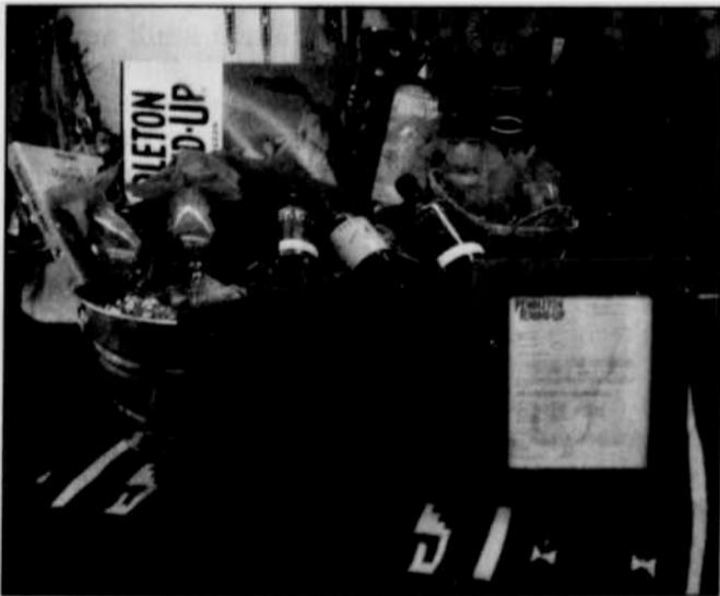
Pendleton Round-Up basket on display at Murrays Drug

The tickets are for a Pendleton Round-Up themed basket that includes: a Pendleton Woolen Mills blanket; two Wednesday or Thursday tickets for the 2012 Pendleton Round-Up; two adult tickets to the Happy Canyon Pageant; two adult tickets for the Round-Up Hall of Fame; one bottle Round-Up Whiskey; four Pendleton Round-Up glasses; one bottle of Hamley's wine; two Hamley's wine glasses; two Pendleton Round-Up wine glasses; one Pendleton Round-Up cookbook; $50