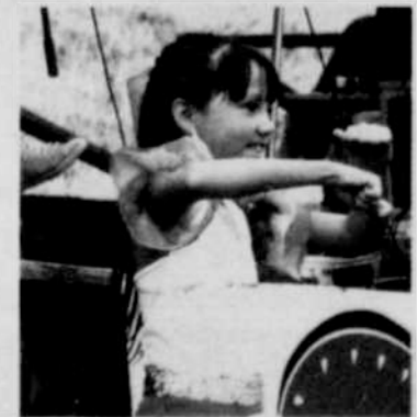
Talent show participant

Come to the Fair on Thursday, August 18, to share your talent and possibly win money. The winners in each group will be eligible to go to the State Fair.