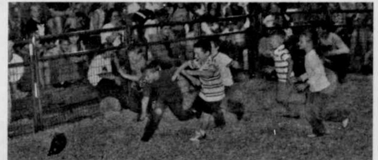
2010 greased pig contest

The contest is open for kids four-six and seven-nine years old. The cost is $5 per participant. Entries are limited and parents must sign a waiver. Sign up is during fair week at the fair office.