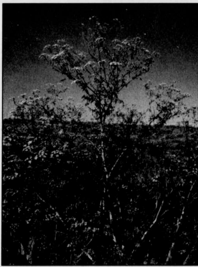
Poison hemlock plants like this one have been cropping up throughout Morrow County due to heavy spring rains.

Poison hemlock ( Conium maculatum ) is a member of the parsley family and is often mistaken for wild carrot or cow parsnip. It is a biennial that usually grows six to eight feet tall. It has extensive branches that are smooth, erect and solid with distinct ridges. It also has distinctive purple spots on the lower parts of