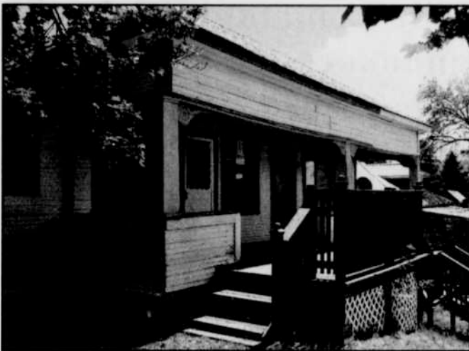
The Heppner city council recently purchased this HUD house on Court Street for one dollar.

Purchased home for $1 In other business, the council discussed its recent purchase of a former Housing and Urban Development (HUD) house for one dollar. The house, located at 160 S. Court St in Heppner, had been reposed by HUD and has been on the market for six months and not sold. According to HUD's website, HUD's Dollar Homes initiative "helps local governments to foster housing opportunities for low to moderate income families and address specific community needs by offering them the opportunity to