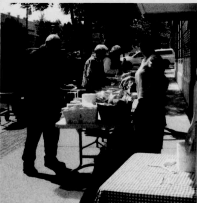
Community Bank serves barbecue lunch to Heppner community