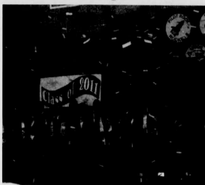
Heppner Seniors prepare to depart graduation ceremony amid flurry of confetti.