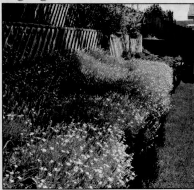
A profusion of perennials, like these "Snow in Summer" plants, won Neva DeMayo's backyard a Garden Highlight award from the Garden Club.