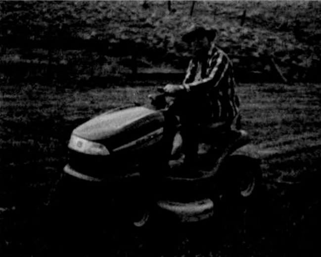
An Odd Fellow hard at work.