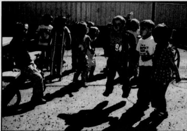
Three- and four-year-old students at Heppner DayCare participated in the Muscular Dystrophy Association's Hop-a-Thon on May 4. The kids gathered pledges based on the number of times they could hop, and they money they raised went toward the MDA's programs. The event also helped raise awareness for the MDA's programs.