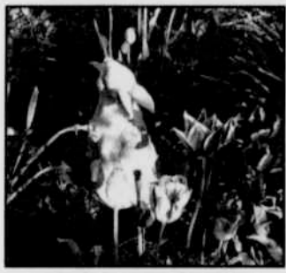
A whimsical bunny peers out of the flowers in one of the winners' gardens. -Contributed photo

The Featured Garden recognition honors those with exceptional seasonal highlights, special outdoor projects or rural locations. To suggest a place for this honor, contact Kay Proctor of the Heppner Garden Club.