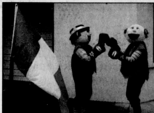
Two leprechauns were found working on their boxing skills in preparation for Friday's Irish Boxing Smoker. The smoker is just one of many St. Patrick's Celebration events that will be held throughout Heppner this weekend.

llllllllllllllllllllll Bessie Wetzell Newspaper Library University of Oregon Eugene, OR 97403