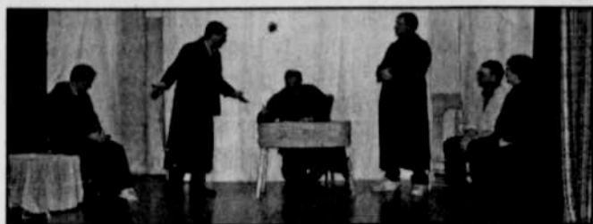
Cast members of "Oliver" practice for their March 13 and 17 performances.