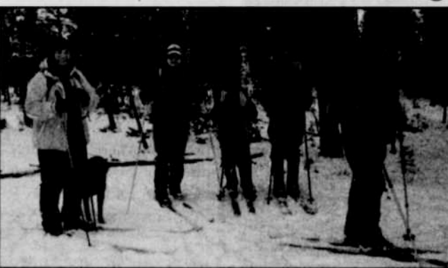
The Arbuckle Nordic Club had seven skiers for this past weekend. The group started on the 22/2122 junction and made a loop back to the 22 road. It was overcast and cold, about 16 degrees.