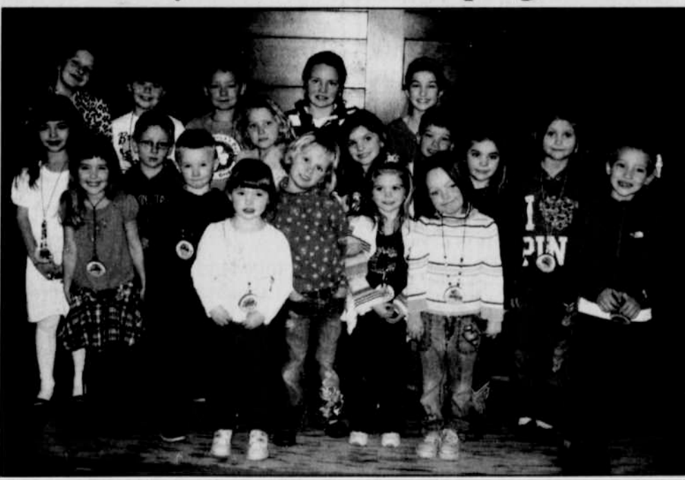
Pictured are the Friends of Jesus at February's First Friday program. The next session of First Fridays Friends of Jesus, sponsored by Hope Lutheran Church and All Saints Episcopal Church, will be held on Friday, March 4, from 8 a.m. to noon at All Saints. Children ages four through sixth grade are invited to join in on a morning of Bible stories, games, crafts, music, snacks, and lots of fun. A free lunch is served, and there is no cost to attend. To register, or for more information, call the church office at 541-676-9970.