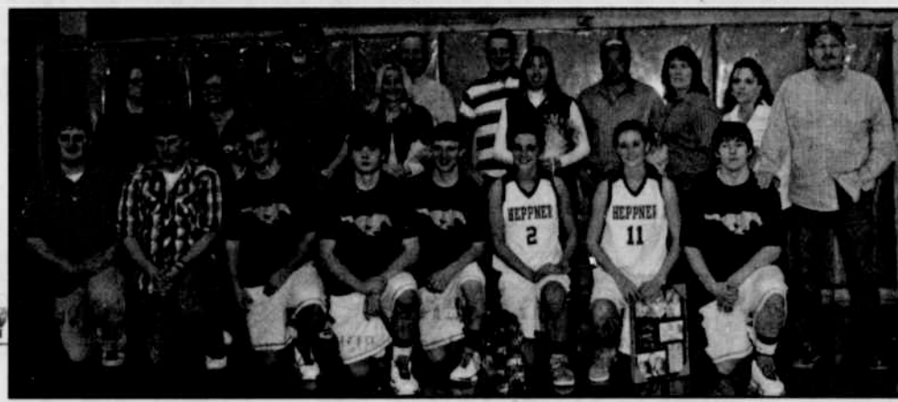
Senior basketball players and pep band members were honored on Saturday night during the final home basketball games of regular season play.