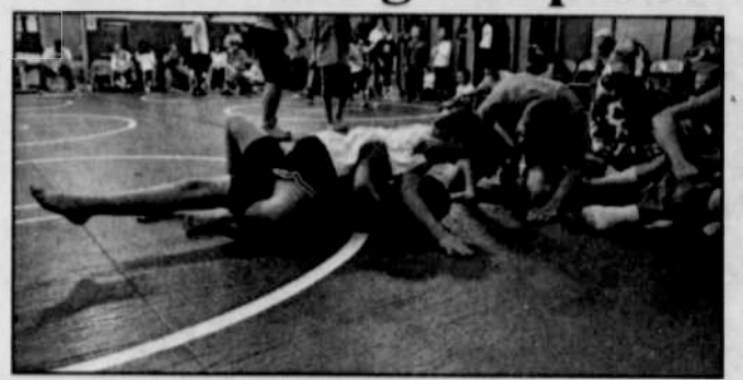
Pictured are participants in a Colt wrestling camp that was held recently.