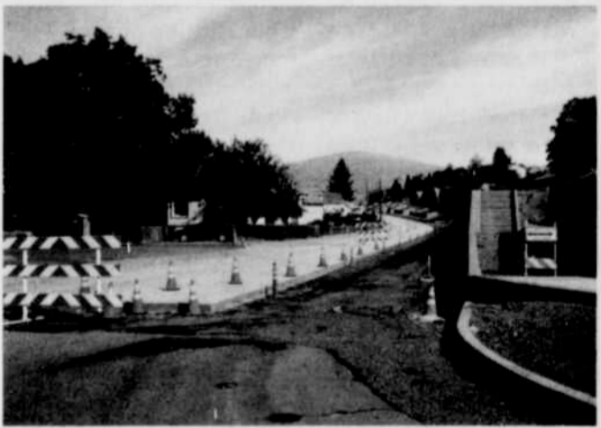
The Heppner Court St. reconstruction project was funded with $1.5 million in federal stimulus dollars.

$1,741 - Replace irrigation main line at McCormack Unit at Umatilla