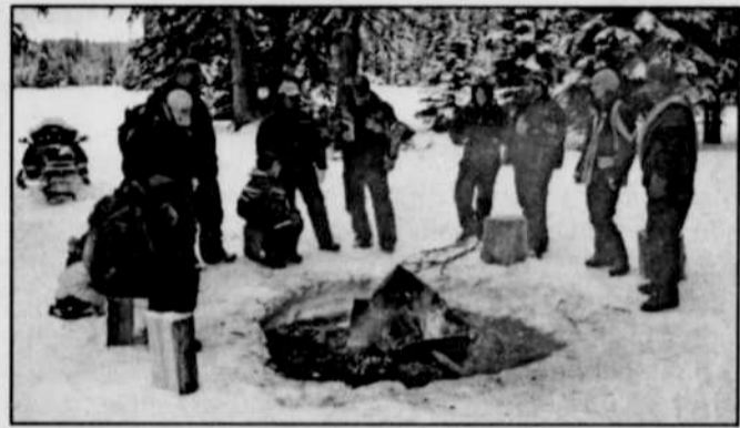
Left Photo: A young rider gets ready to go. Right Photo: members warm up to a campfire.

trails from grooming extraordinaire Ron Carlson and the annual poker run that paid out 100% of the entry fees. A two dollar entry fee and a good running sled around about a 10 mile poker course gave three lucky snowmobilers a cash