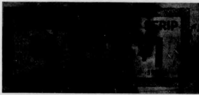
An Arcata California man found this Heppner sheepskin scrip in a second hand store in Eureka, CA. He sent it back "home" to Heppner.

"While there I visited your area twice -