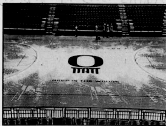
Pictured is the new basketball court, Kilkenny Floor, at the University of Oregon.

Materials Floor is a Connor Sports Flooring Quicklock Portable Floor (The same surface used for NCAA Men's and Women's Basketball Championships). Floor was manufactured in the upper peninsula of Michigan in the town of