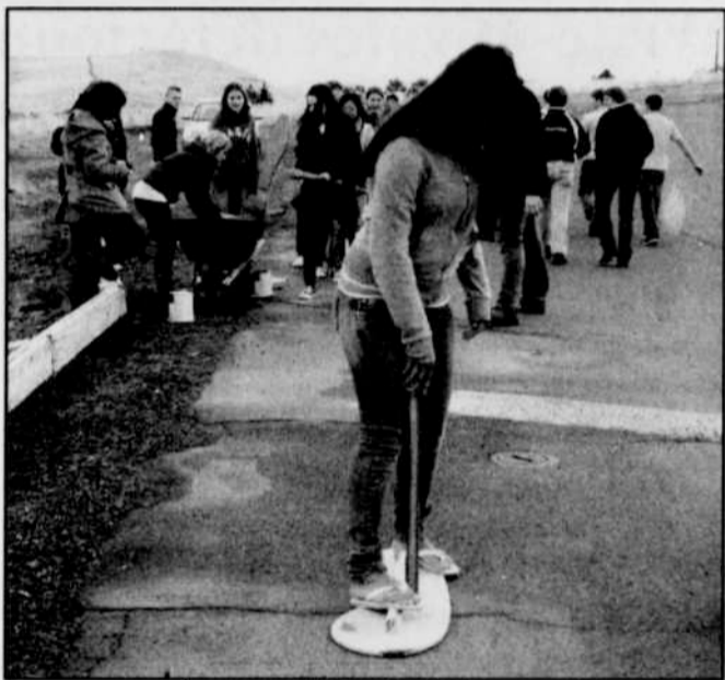
Last week at Heppner High School was Red Ribbon Week. This year's theme for the week was, "Take a step towards being drug and alcohol free." To represent the theme, the whole student body printed giant foot prints going around the perimeter of the school in bright red paint on October 26. Overall the week was a great success and was concluded on Thursday with all of the students wearing red.