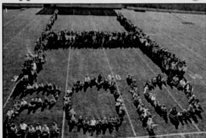
Pictured are students and staff of Heppner Elementary and High Schools, and a few community members, on October 21 at the Mustang football field in Heppner. The cause for the celebration was the "Outstanding" rating both Heppner Elementary and Heppner High received from the Oregon Department of Education. The pink shirts worn by most people in the photo were a tribute to Breast Cancer Awareness Month.