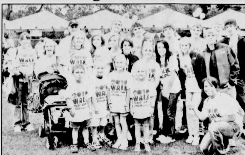
Pictured are members of this year's Beth's Buddies JDRF Walk to Cure Diabetes team.

Beth's Buddies is a team formed to support