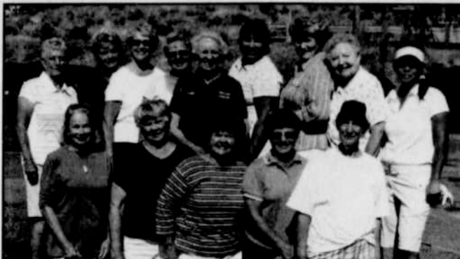
Pictured are participants in the last Ladies Play Day of 2010.

The finals Ladies Play Day of the season was held on Tuesday, September 28, at the Willow Creek Country Club.