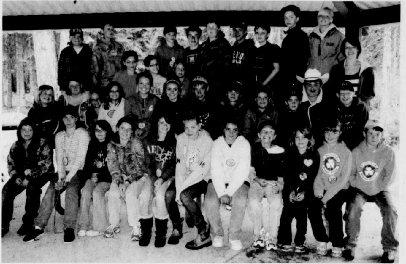
Morrow County campers and counselors