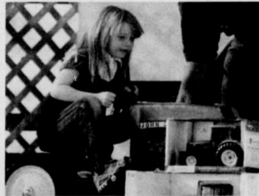
2009 Pedal Power participant

RDO Equipment will be bringing their Pedal Power Tractor to the fair for pull offs again this year. The age groups are: four years and under, five-six years, seven-eight years and nine-10 years. Sign ups are the day of the show, Wednesday, August 4, at 5 p.m.