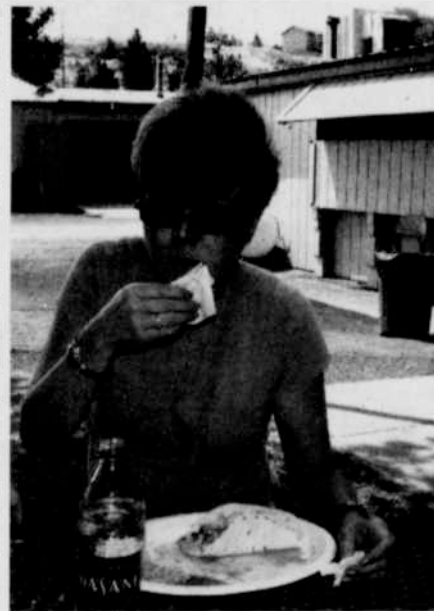
Fairgoer enjoys lunch

Sweet Productions will be in the kitchen by the Fair Office with sandwiches, ice cream, funnel cakes, elephant ears and other goodies. All are invited to come and try out the many different foods at the Fair this year, so come on down and eat at the Fair, "where there is something for everyone."