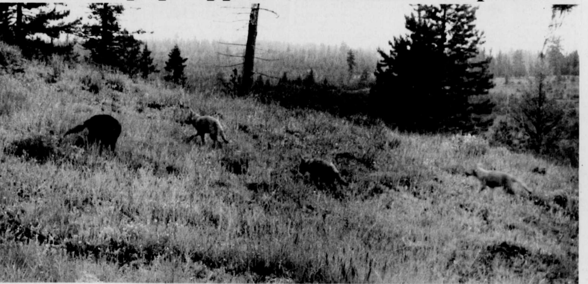
Imnaha wolf pups

The Imnaha wolf pack has at least four new pups this year, images captured on a motion-triggered trail camera show. An image taken July 3 marks the first visual observation of