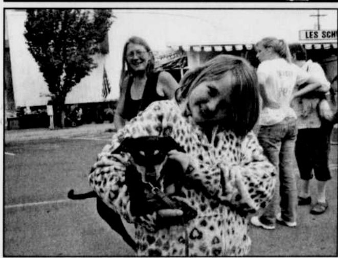
Pictured above are scenes from Celebrate Heppner on June 11.