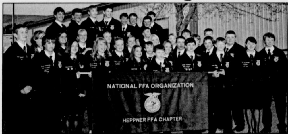
Pictured are members of the Heppner High School FFA chapter.