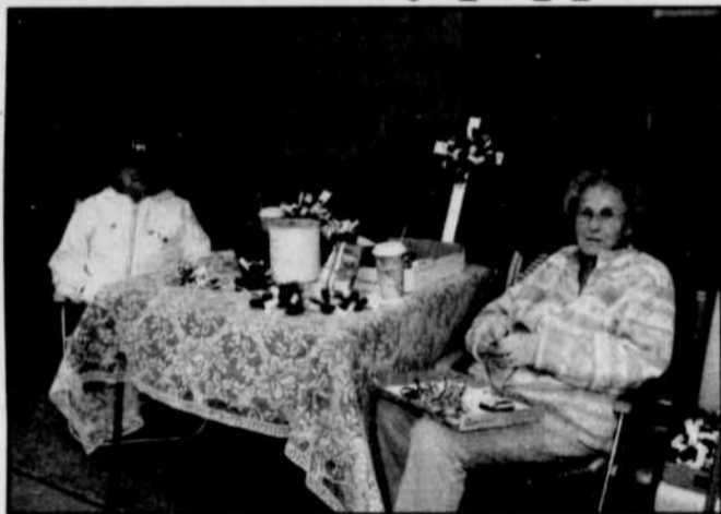
Members of the Heppner American Legion Auxiliary sold Memorial Day poppies on Thursday, May 27, in front of the Heppner Post Office.