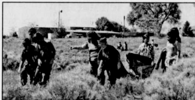
Students from Windy River Elementary School helped clean up the town of Boardman on May 13. For the past four years the students have armed themselves with garbage bags and helped with the clean-up process.

This is the fourth year the school has participated in the clean up. It is organized each year by Windy River staff and the City of Boardman's Code