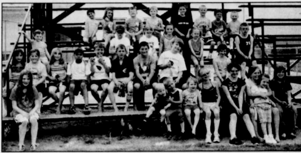
Pictured are participants in the 5 th annual Youth Track Meet held in Ione.

Anyone who would like to make a dessert to be auctioned off to help support the Heppner Chamber and this year's event just needs to prepare your favorite dessert and take it