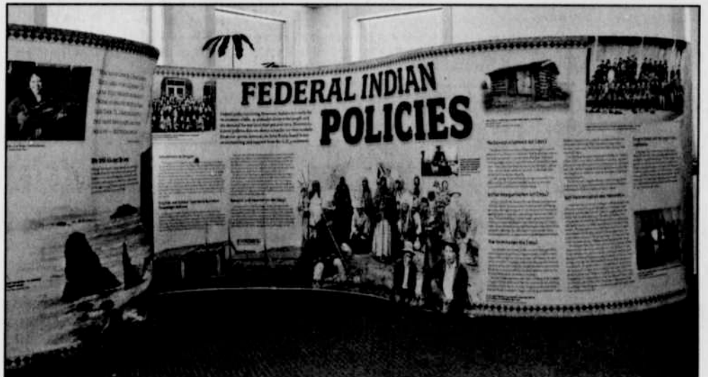
A display depicting the history of Indian tribes in Oregon is currently set up at Heppner City Hall. The display, which is sponsored by the Oregon Historical Society, can be viewed through May 25.