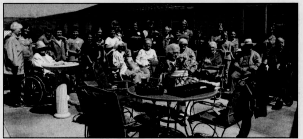
Fifth grade students from Heppner Elementary School visited Willow Creek Terrace where they planted flowers on Earth Day. The students are pictured with residents of the Terrace.