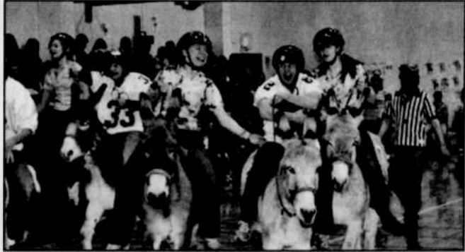
Heppner High School FFA held their annual Donkey Basketball fundraiser game on Thursday, March 11. HHS FFA played against Pilot Rock's FFA.